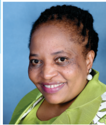
Cllr. Busisiwe Modisakeng Executive Mayor Sedibeng District Municipality