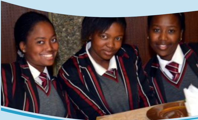
Winners of the 1st Prize in the Old Schools Category