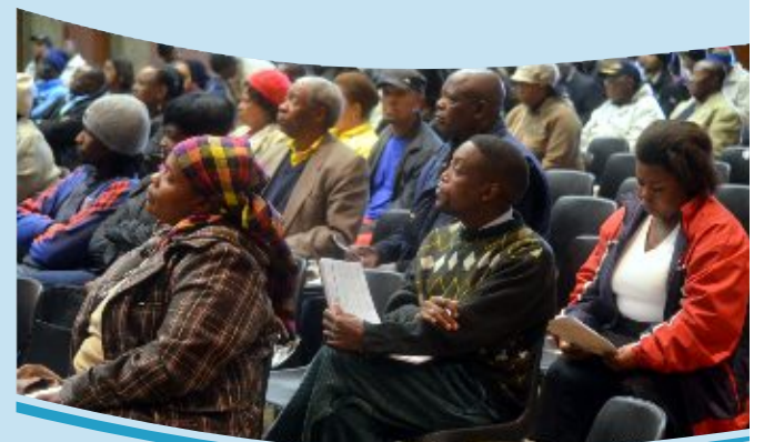
The public and stakeholder groups can making inputs on the Development plans on their Municipalities.

The final Approval stage requires that the final IDP Document be approved by the Municipality and submitted to the MEC.