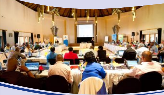
Delegates from Sedibeng District, and Emfuleni, Midvaal and Lesedi Local Municipalities at work during the IDP Alignment Lekgotla.

The Sedibeng District and its three local Municipalities, namely; Emfuleni, Midvaal and Lesedi embarked on an intensive 2 day program to work on the alignment of the 5-year IDP's and Budgets of each Municipality. By the end of March 2012, all Councils adopted the next 5 Year IDP's, which were subjected to public scrutiny during the month of April 2012.