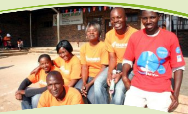
The CWP is also a great opportunity for unemployed youth who are actively looking for employment opportunities. The programme will give you that much needed extra cash to make you effective in your search for full-time or part-time employment.

Upon approval and appointment of a new site, the DCoG will liaise with the relevant Municipality in order to enlist their support and cooperation, beginning with the site inception phase.