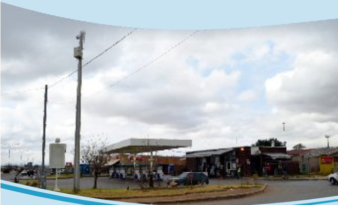
CCTV Camera at a busy intersection on Seiso Street in Sharpeville

The installation of the CCTV Cameras in the Region augments and strengthens our continued community mobilisation and partnerships against crime. It is our continued commitment to ensure that the people of Sedibeng's ability to enjoy a decent life is not undermined in any way.