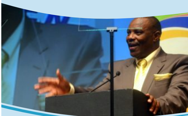
The Executive Mayor delivering the State of the District Address 2012

The Executive Mayor in an inspiring address, televised live to 5 satellite venues across the District (Heidelberg City Hall, Salvation Church in Sicelo, Evaton Community Centre, Sharpeville Hall and Mphatlalatsane Theatre in Sebokeng), announced the 10 flagship projects of GDS-02 that are to underpin and stimulate the economy for growth and job creation.