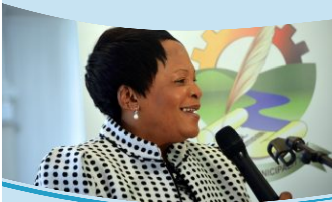
Gauteng Premier Nomvula Mokonyane talking to the youth.

The event was hosted at a Guest Lodge in Vanderbijlpark on the 7 and 8 August and this year's programme saw the Premier of Gauteng, Ms Nomvula Mokonyane engaging the young people on the contents and objectives of Gauteng's long term strategic vision known as the Gauteng Vision 2055. This programme will be used to take young people in confidence and on board on the Sedibeng District Municipality's vision towards the Vaal Metropolitan River City.