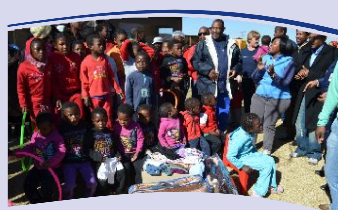
The Executive Mayor and his entourage delivered much needed blankets to the Children's Centre in Zone 12 Sebokeng.