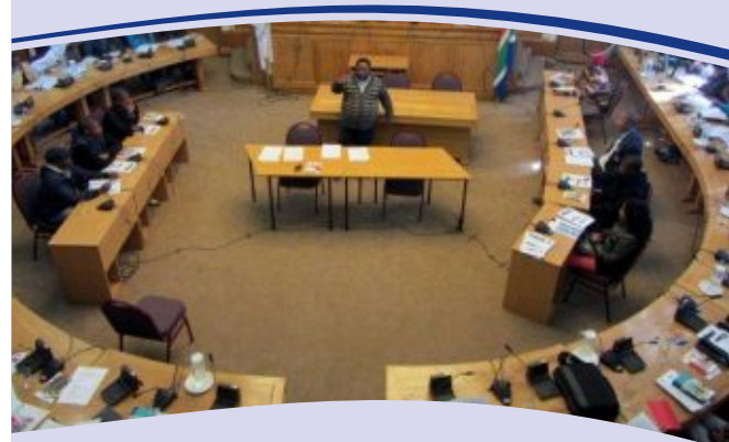
Sedibeng Youth Parliament in action at the Mayor's Parlour in Vereeniging

On the 8 June 2012, in Vereeniging the youth of Sedibeng from different organisational structures met to discuss, and debate youth related issues and elect the Sedibeng Youth Political Management Team comprising of the Youth Executive Mayor, Youth Council Speaker and Youth Council Chief Whip.