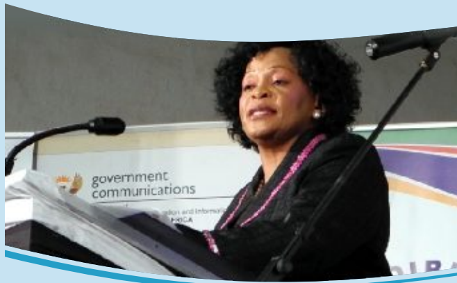
Premier of Gauteng Province: Nomvula Mokonyane, delivered the keynote address