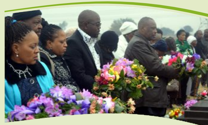
Dignitaries and relatives of the victims lay wreaths on the graves of those who lost their lives in the Boipatong Massacre