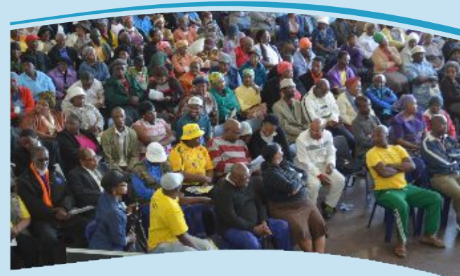
A large crowd gathered at the Mafatsane Multi-purpose hall in Evaton to commemorate the Vaal Uprising of 1984.

It is with the above assertions that the Sedibeng District Municipality, invited the people of Sedibeng to the memorial lecture in commemoration of this historic anniversary. This year's Commemoration was held under the theme, "Towards A Vaal Metropolitan River City".