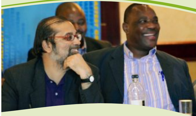
Deputy Minister of Cooperative Governance & Traditional Affairs: Mr. Yunus Carrim and the Executive Mayor of Sedibeng, Cllr. Mahole Simon Mofokeng at the Lekgotla

This type of Lekgotla comes once in five (5) years and becomes a platform for a festival of ideas by all Mayoral Committees in the Sedibeng District Municipality with an objective of charting a way forward in the current term of office and converting all ideas into properly aligned programmes.