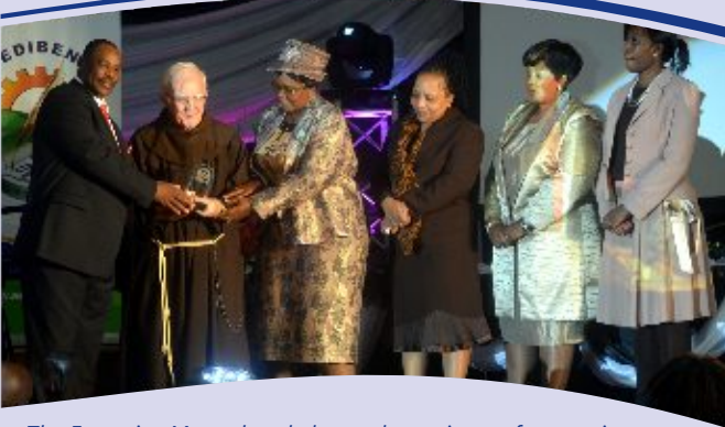
The Executive Mayor handed awards to winners from various categories and sub-categories.

For more photos visit www.sedibeng.gov.za