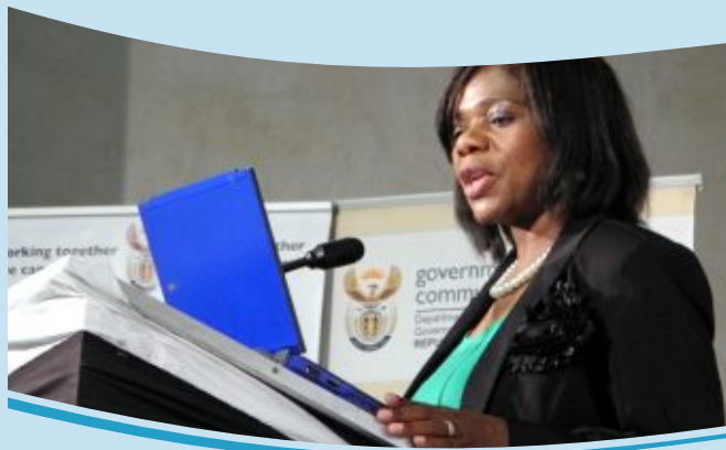
Public Protector: Thuli Madonsela made a presentation to the audience at the newly opened Sharpeville Hall.

The opening of the hall is significant in the sense that it is in line with our continued commitment to Renewing Our Communities, Releasing Human Potential and building a better for life all.