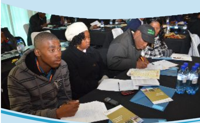
Some of the delegates that attend the summit.

This year's Programme was held under the theme: "The Youth of Sedibeng meets to discuss the future of their Region and Province - Towards A Metro & Gauteng 2055 Strategy"