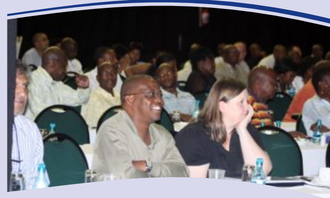
Delegates at the Sedibeng Growth and Development Summit

"The long walk continues, in the spirit of deepening democracy and in ensuring that communities play a role in shaping their future, the product of the Summit is owned by our communities as our partners and stakeholders. The roadmap ahead as informed by the 5 R's plus 2, is made clearer through your inputs which cast the light when the road was not clear.", said the Executive Mayor of the Sedibeng District Municipality: Councillor MS Mofokeng when closing the Summit.