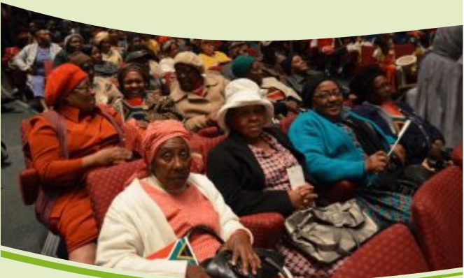
A large crowd gathered at the Civic Theatre to listen to presentations by experts on the Anglo-Boer War.

The Sedibeng District Municipality, which has a programme of commemorative events as one of its GDS Flagship Projects, aims to mark the 31 May every year with a variety of themes surrounding the impact, and lessons learnt, from the Anglo-Boer War.