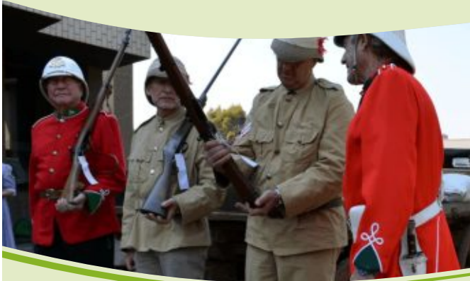
Some of the guests who attended the 110th Anniversary of the signing of the Peace Treaty of Vereeniging