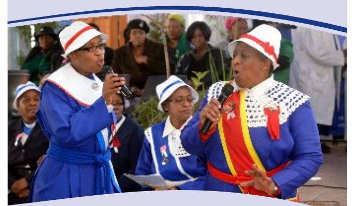
The church service at the Memorial Lecture was filled with inspirational singing.