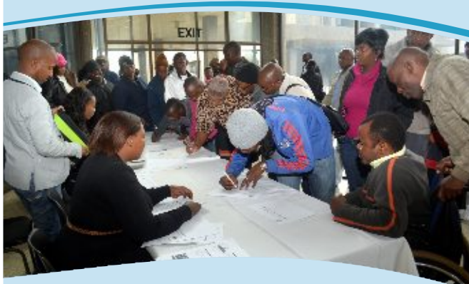
Registration at an IDP Public Participation Meeting

The Sedibeng District Municipality develops the Integrated Development Plan or IDP Framework in conjunction with its three Local Municipalities (Emfuleni Local Municipality, Midvaal Local Municipality and Lesedi Local Municipality). The Framework for the IDP is developed in a period of five years and can be reviewed annually when the IDP Process Plan is developed. The IDP Process Plan for 2013/2014 was approved by Council on the 29 September 2012.